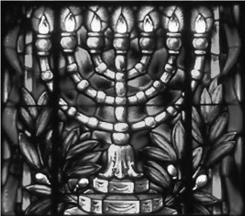
Image from: "Age of the Torah" stained glass window, Holy Blossom Sanctuary.

If you require special consideration for seating or parking (for those with handicapped permits only) on the High Holy Days, please fill out the request form in your Membership Renewal package. Large-print prayer books and hearing devices are available in the Temple Office before each Service begins. We will do our best to accommodate all requests on a first-come, first serve basis. If you have any question, please call the Temple, at 416.789.3291, ext. 516.