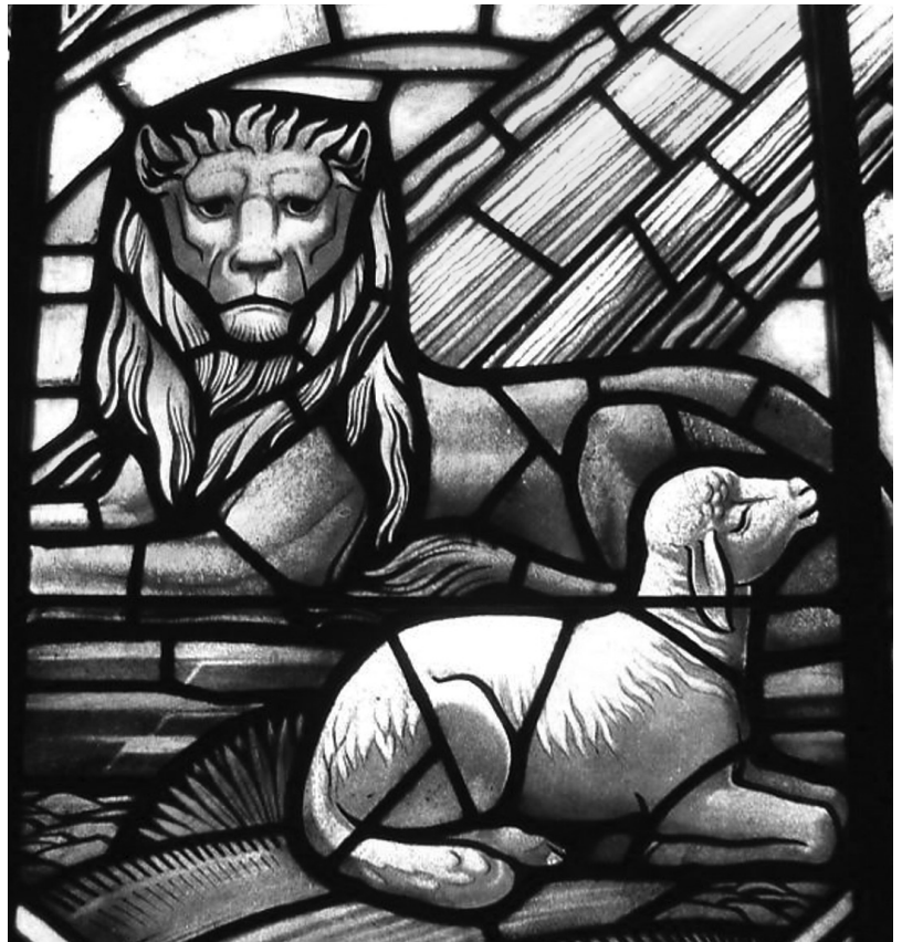
Image from: "Age of the Prophets" stained glass window, Holy Blossom Sanctuary. Photo – Paul Hellen

Cover Image from: "Age of the Torah" stained glass window, Holy Blossom Sanctuary. Photo – Paul Hellen